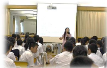
中一級歷奇教育營前講座

本學年循環周 B5 當天第 7、8 節為「生命教育」課節，時間為 80 分鐘。此課節目的是提升學生正面的價值觀和積極的健康生活模式，本年度主題為「正向新視野·突破迎挑戰」。