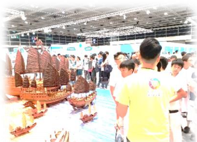
中二級同學參加「創科博覽 2017」探 究活動，探究鄭和下西洋寶船設計

本組與資優教育組等組別於 9 月 29 日帶領中二級同學參加由團結香港基金主辦「創科博覽 2017」探究活動。活動主題定為「鑑古追今，開創未來」，以中華古代科技文明與今天中國創科成就為主軸，展現中華民族的智慧與氣度，古今傳承。《創科博覽 2017》展出近 130 項展品，其中 28 項是古代珍貴的創科發明。藉此展示出中華民族廣博的智慧與堅韌的生命力，加深認識國家的古今成就，分享身為中國人的驕傲。各同學分組輪流參觀五個展區，包括三大主題展區「天」、「訊」、「海」，以及「中科院互動展區」和「香港之光」展區，並參加不同主題科普講座，從而認識到國家的最新發展和成就。