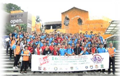
We Explore • Experience • Enrich (5 Nov 2017)