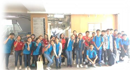
We gathered together to learn new things on 9 November 2017.

I learned more about Singapore. Hong Kong and it have many things in common. For example, both of them have remarkable trade development and a variety of races. The race inclusion enriches the development of multi-cultural society. Furthermore, all of us learnt from the centralized programmes the importance of teamwork and communication. We treasure our friendship. The more we communicate and work together, the more we understand our team members. I learnt more while I was studying in the secondary school in Singapore. I look forward to participating in more exchange programmes of this kind.