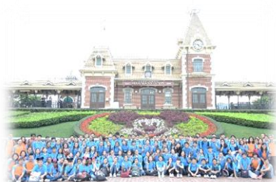
We're friends forever!