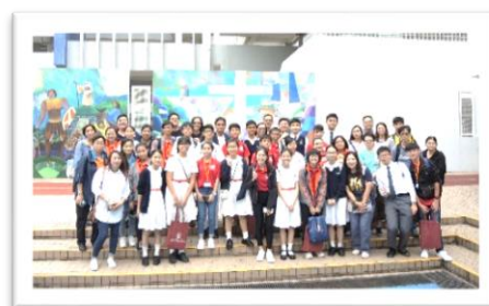
Parents, teachers, Singapore buddies and SGSS students (4 November 2017)

After joining the Singapore-Hong Kong Exchange Programme, I learnt we need to be brave and communicate with others effectively. I became more independent and confident. I had many unforgettable memories.